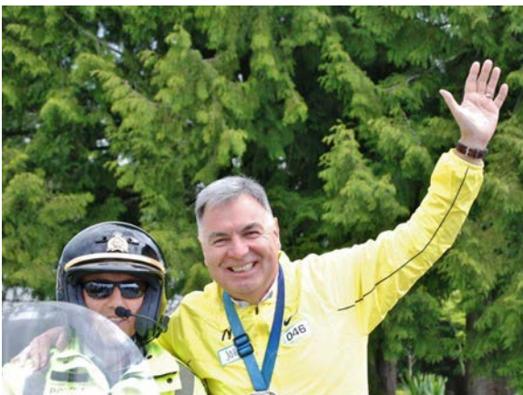
Rick Hansen Medal Relay