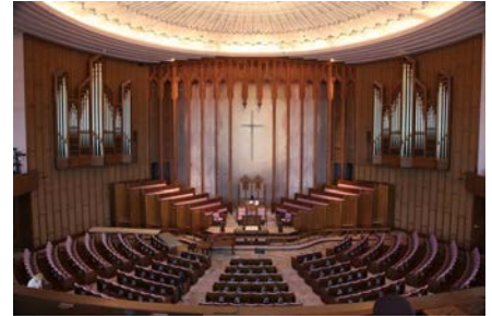
Boston Avenue Methodist Church

Prior to the CRA's Annual Meeting, the Tulsa International Mayfest will be held May 15-18 with outdoor fine arts and crafts, four stages for performing arts, festival food, and five indoor galleries. For further information on the Tulsa events go to www.visittulsa.com .