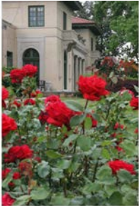
Tulsa Rose Garden

Tours for spouse/guests of Annual Meeting attendees will include the Tulsa Rose Garden, Linnaeus Teaching Garden and Philbrook Museum and gardens on Sunday. Then on Monday they have the opportunity for a short walking tour of some of the Art Deco downtown office buildings and an interior tour of the Art Deco Boston Avenue Methodist Church.