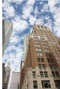
Art Deco Buildings