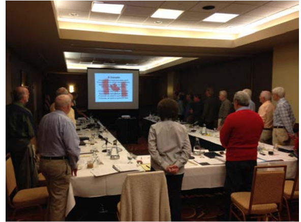
Delegates sing “O Canada”