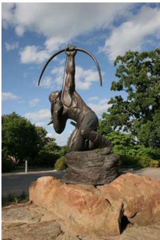
Sacred Rain Arrow