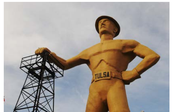
The Golden Driller

Tulsa is nestled in the wooded hills of eastern Oklahoma. The original settlement was started between 1828-1832 by Muskogee (Creek) Indians. By 1882 the railroad arrived which helped settle the town. Cowboys drove cattle to the rail yard for shipment to Eastern markets while much of the ranching and farming growth was by Creek families. Growth was slow but steady until 1901 when an oil well drilled on the west bank of the Arkansas River in the small town of Red Fork hit Black Gold. Wildcatters and investors flooded into Tulsa. Then in 1905 another oil field was discovered south of Tulsa that became the world's largest oil reservoir for several years. Texaco built the first refinery in 1910 and at one time 18 refineries were located nearby. By 1915 Tulsa was transformed from a cow town to the "Oil Capital of the World." That title was relinquished to Houston in the early 1980s. In the 1950s, Tulsa was dubbed "America's Most Beautiful City", partially due to its abundance of Art Deco-style buildings.