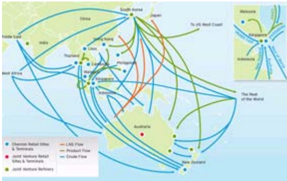
Flow of Chevron products in Asia-Pacific.